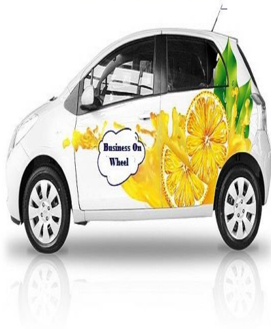
Advertisement On Car

We offers advertisement on Cars, Bus and Auto to suit individual budget and marketing requirement.